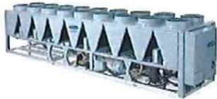
Hail Guard Not Shown

Unit Length (Steel Base): 235 in. Unit Length (w/ Control Panel): 255 in. Unit Width: 88 in. Unit Height: 99 in. Refrigerant Type: R-134a Refrigerant Weight (Circuit A): 130 lb. Refrigerant Weight (Circuit B): 140 lb. Shipping Weight: 13,250 lb. Entering/Leaving Water Connections: 5" Victaulic