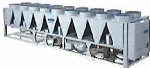
Hail Guard Not Shown

Unit Length (Steel Base): 282 in. Unit Length (w/ Control Panel): 299 in. Unit Width: 88 in. Unit Height: 99 in. Refrigerant Type: R-134a Refrigerant Weight (Circuit A): 170 lb. Refrigerant Weight (Circuit B): 180 lb. Shipping Weight: 16,939 lb. Entering/Leaving Water Connections: 8" Victaulic